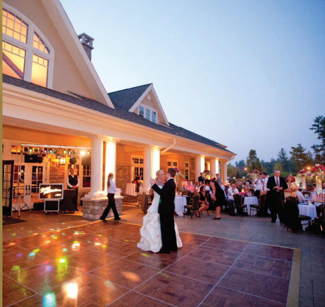
The Resort venues seat up to 250 wedding guests on our exceptional patio settings.

THE ENTIRE TEAM AT TULLYMORE WILL WORK WITH YOU TO BRING YOUR VISION TO LIFE. WE ALSO PARTNER WITH AN EXTENSIVE TEAM OF TRUSTED AND PREFERRED SUPPLIERS FOR OTHER SERVICES LIKE FLOWERS, PHOTOGRAPHY, TRANSPORTATION, AND MORE.