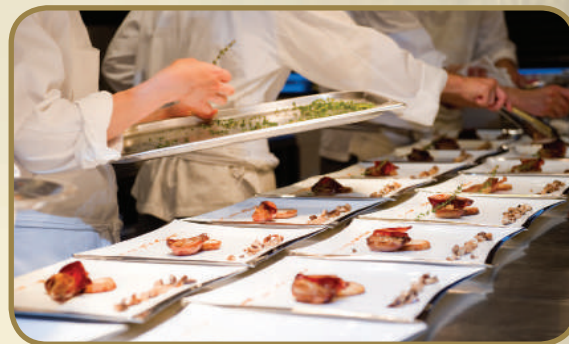
Our culinary team will work with you to prepare the perfect menu.